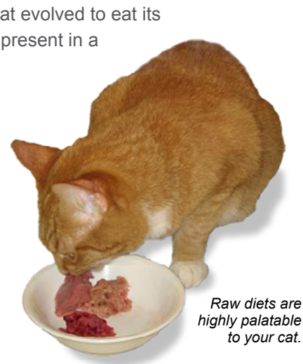
© 2015 Feline Nutrition Foundation Ver 1.4