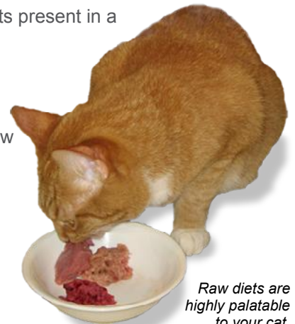
Raw diets are highly palatable to your cat.