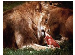
The only difference is size. Your cat has the same nutritional needs as a big cat.

Many different kinds of meat can be used in raw diets. In fact, you should vary the kinds of meat you feed, not only for variety, but also to be sure your cat gets a balanced diet. Chicken, turkey, rabbit, lamb, beef, and many other kinds of meat are available in commercial raw food products.