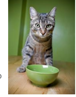
The first step is to stop free-feeding dry food.

The first step is to stop free-feeding dry food. Set up regular mealtimes. Introduce high protein canned food along with the kibble to get her used to the softer texture. Put food out for thirty minutes, then put it away. Your cat can easily go eight to twelve hours be-